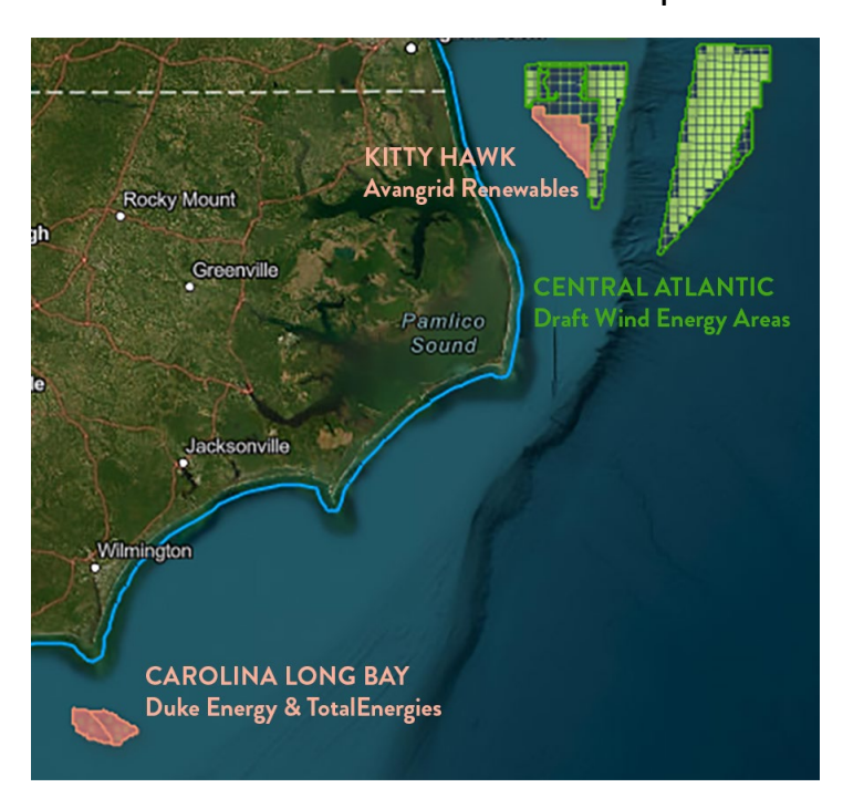
FIGURE 01. North Carolina's Offshore Wind Development Areas

North Carolina Offshore Wind Leases and Draft Wind Energy Areas