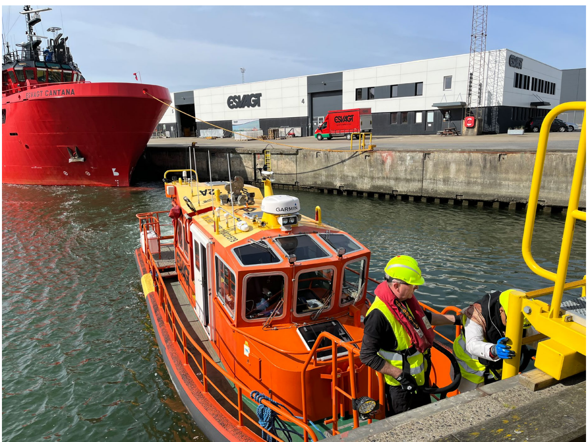
In execution of the MOU, a delegation from North Carolina traveled to Denmark in April to meet with DEA counterparts, attend WindEurope 2023, visit offshore wind OEM facilities, and tour the "Energy" Port of Esbjerg.