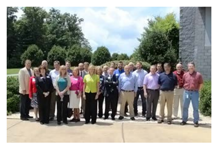
Henderson County Partnership for Economic Development board members and directors at a luncheon on Aug. 2 celebrating the Continental Automotive announcement